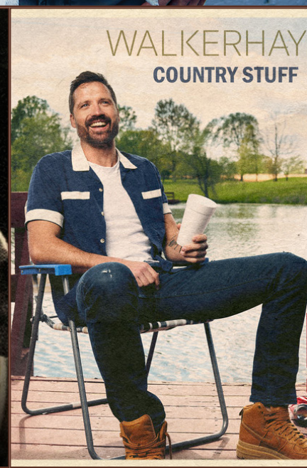
WALKERHAYES COUNTRY STUFF